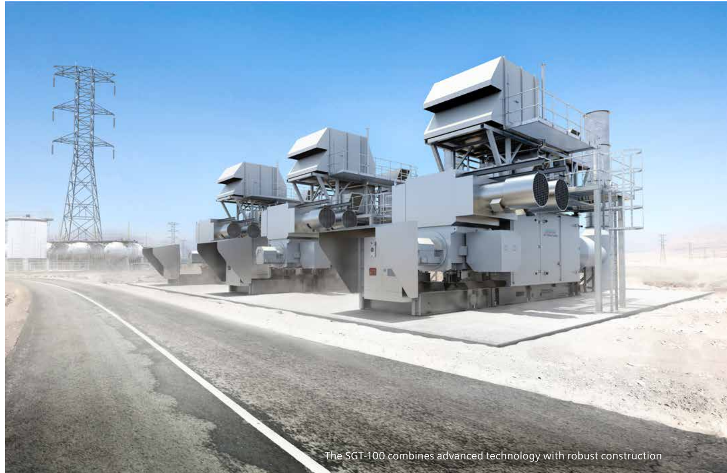
The SGT-100 combines advanced technology with robust construction