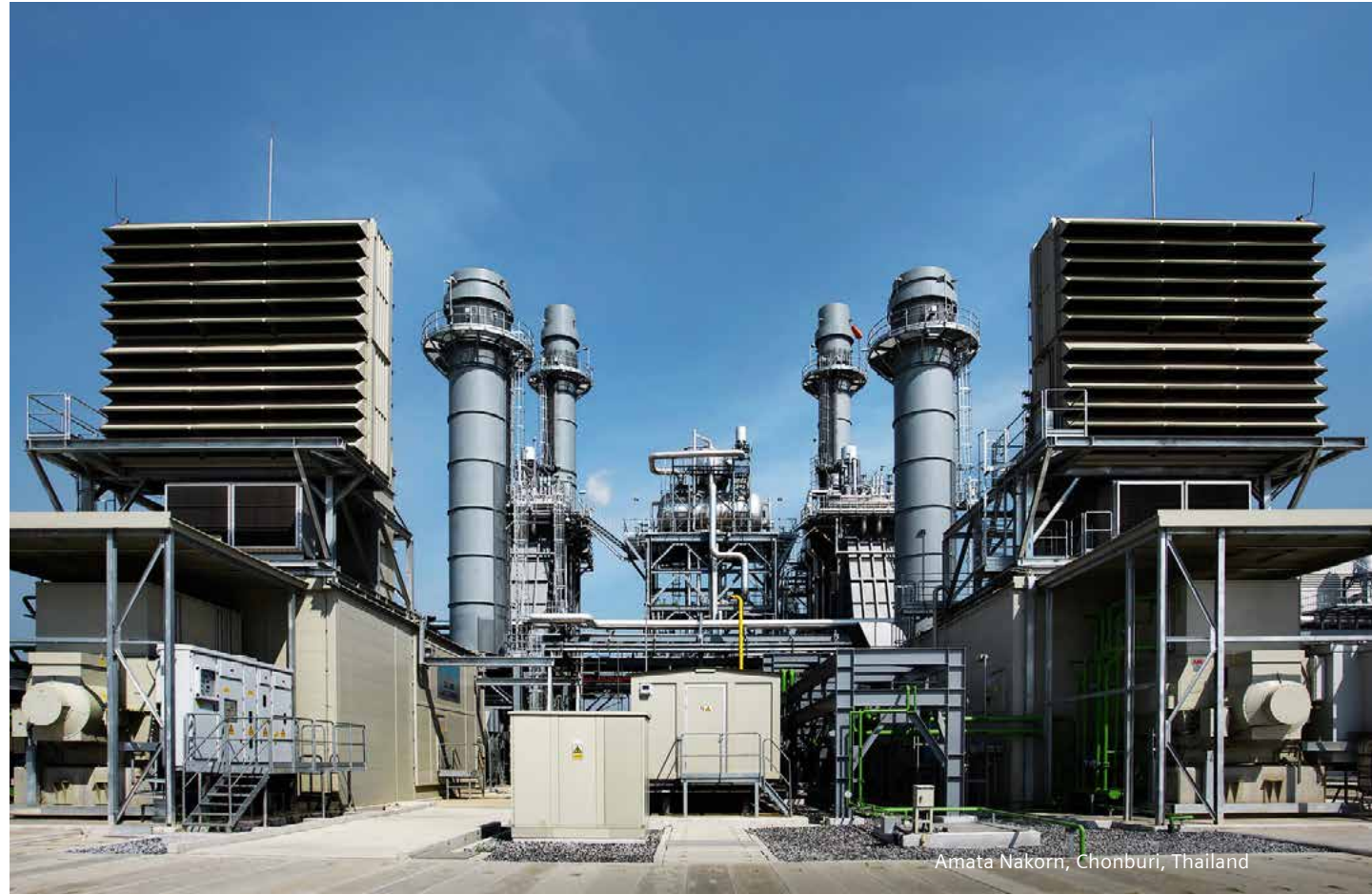
Amata Nakorn, Chonburi, Thailand