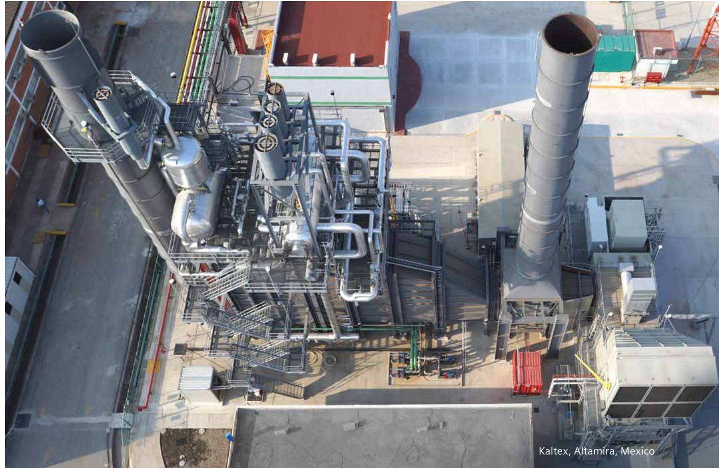
Kaltex, Altamira, Mexico