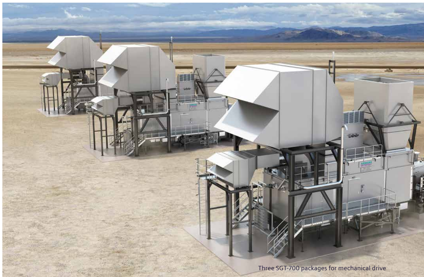
Three SGT-700 packages for mechanical drive