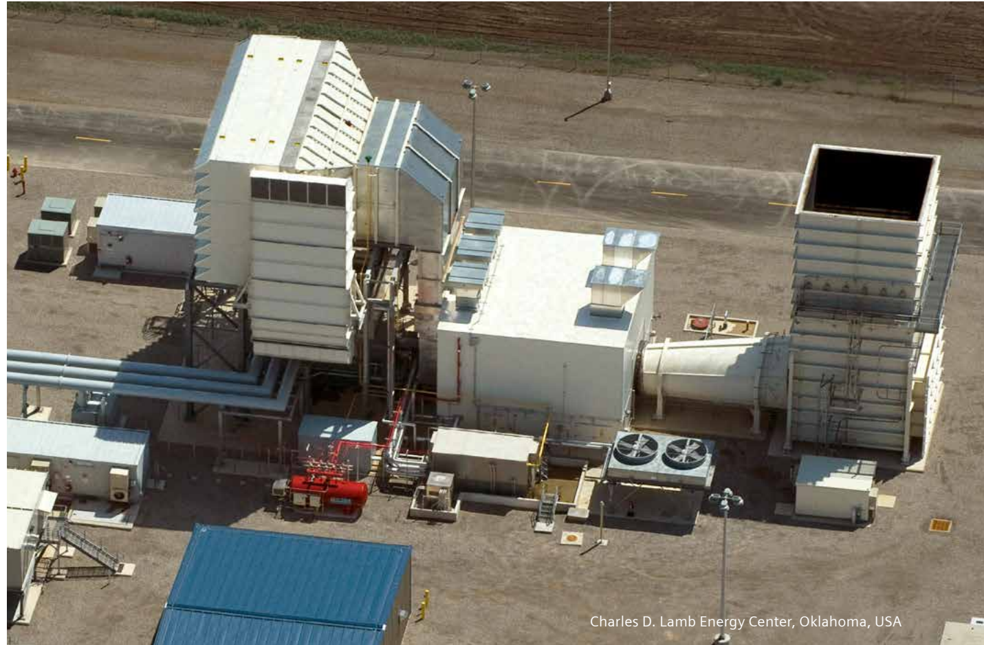
Charles D. Lamb Energy Center, Oklahoma, USA