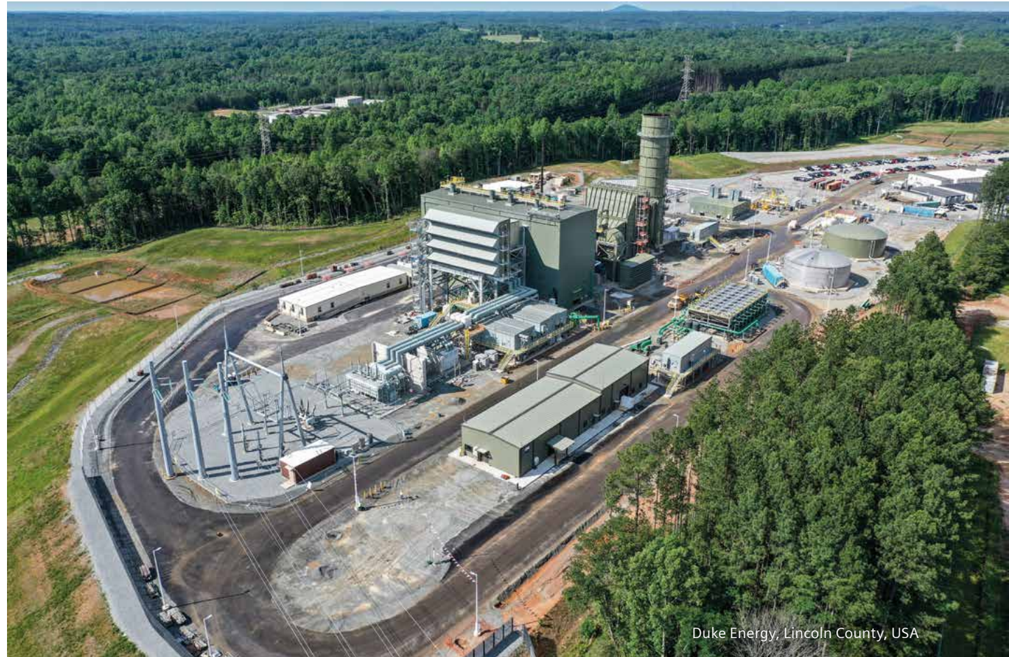
Duke Energy, Lincoln County, USA