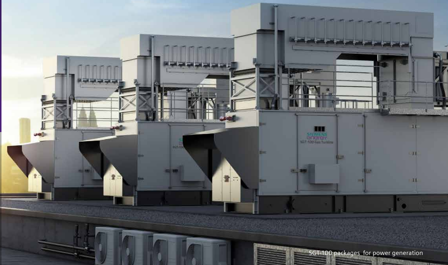
SGT-100 packages for power generation

Our models range from 2 to 593 MW, fulfilling the requirements of a wide spectrum of applications in terms of efficiency, reliability, flexibility, and environmental compatibility. The products offer low lifecycle costs and an excellent return on investment.