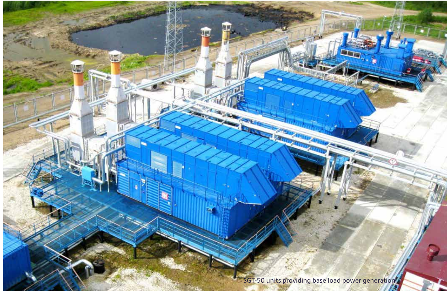
SGT-50 units providing base load power generation