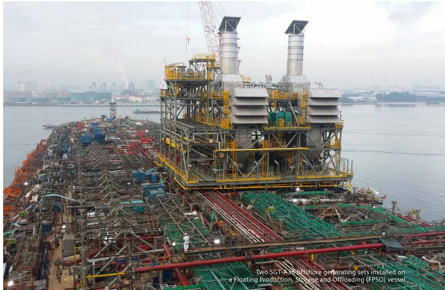
Two SGT-A35 offshore generating sets installed on a Floating Production, Storage and Offloading (FPSO) vessel