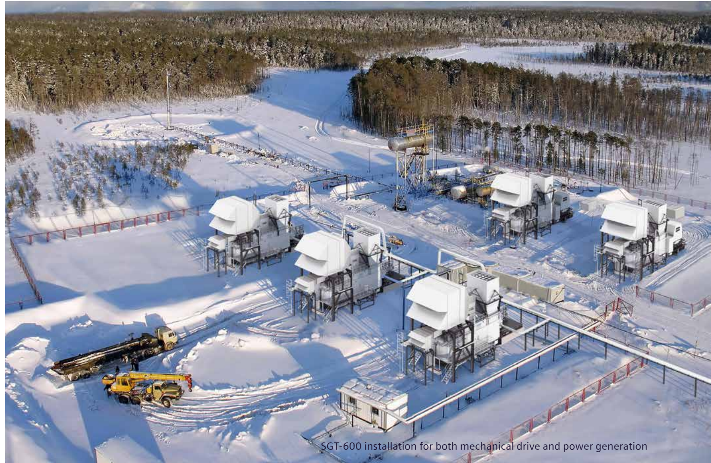
SGT-600 installation for both mechanical drive and power generation