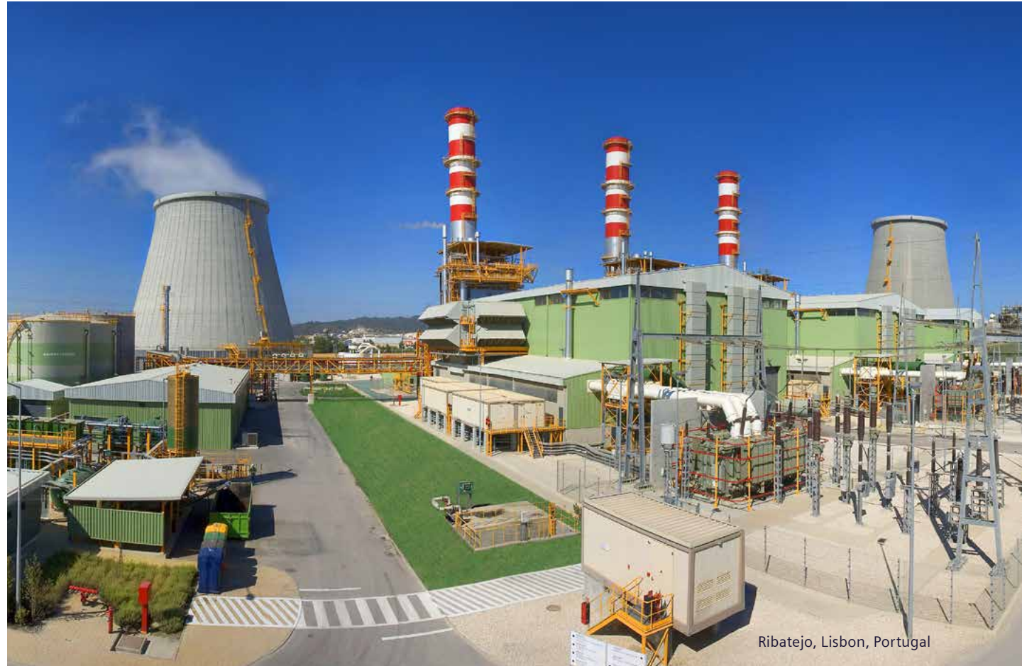
Ribatejo, Lisbon, Portugal