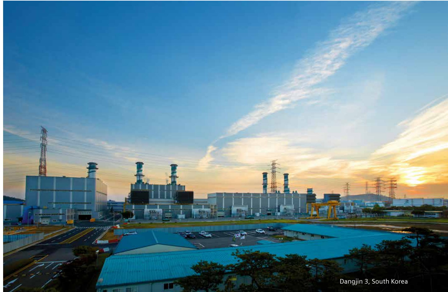
Dangjin 3, South Korea