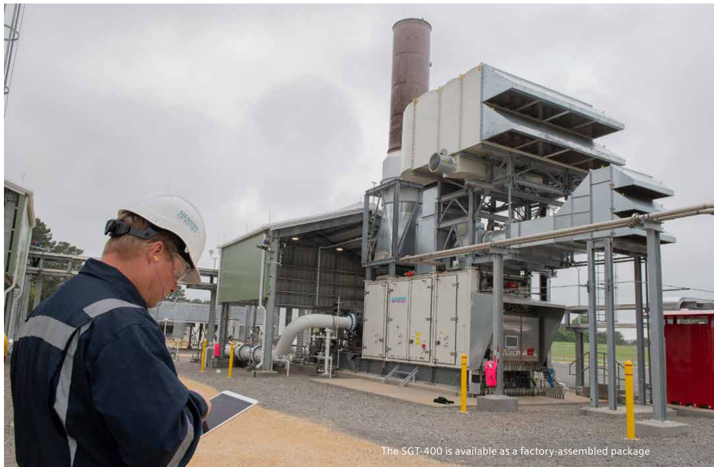
The SGT-400 is available as a factory-assembled package