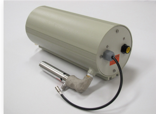
B&W's Diamond Power HTH-8 camera housing operates in ambient temperatures up to 200F.