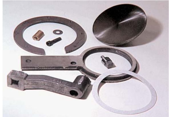
The Style IV airlock retrofit kit is available for high- and low-temperature applications and includes Ni-hard gate and seat, gate arm, heavy-duty coil spring, adjusting screw, gasket, retaining ring, and installation hardware.

Individual installation components make the difference here. The arm and gate combination can be mounted separately. Since there's no need to support and align a heavy combination of parts, maintenance is quicker and easier.