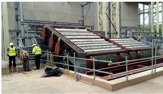
One of two DynaGrate combustion grates being installed