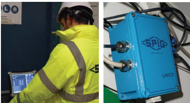
UNICO installation on an air-cooled condenser

B&W provides flexible, customized technical solutions to satisfy most any customer requirement.