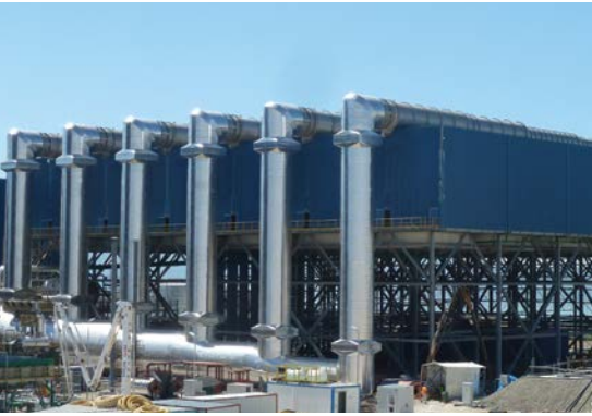
Air-cooled condensers for an 850 MW combined cycle power plant