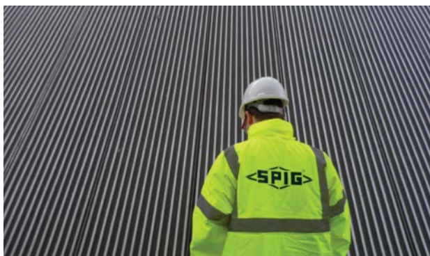
Single-row tube air-cooled condenser