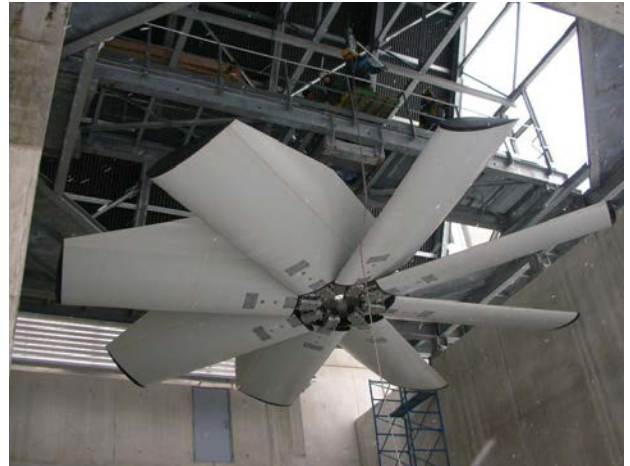
Air-cooled condenser service