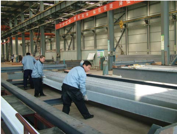
Single-row manufacturing facility