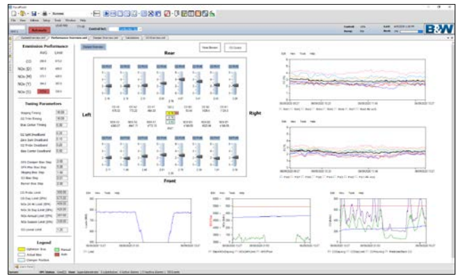
The intuitive user interface of the FocalPoint system allows easy customization and rapid viewing of key parameters.